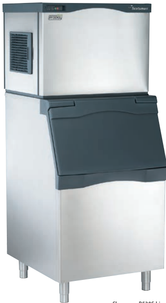
Shown on B530S bin with optional KLP85 legs.