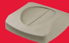
2689-88 Swing Lid Beige