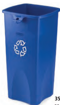
3569-07 23 Gal Square Recycling Container