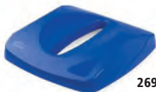
2690 Paper Recycling Top