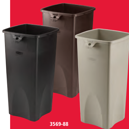
3569-88 23 Gal Square Containers Black, Brown, Beige