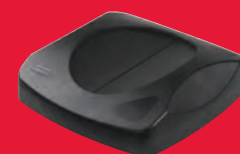
2689-88 Swing Lid Black