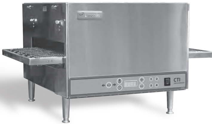
Shown with 31" (787 mm) standard conveyor.