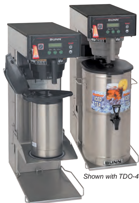
Shown with TDO-4