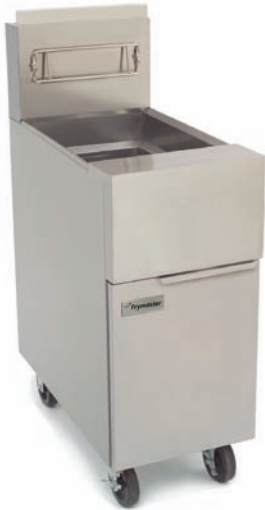
GF40 Shown with optional casters