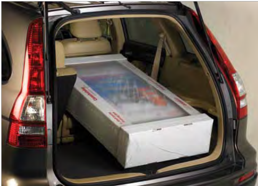
Package conveniently fits into the trunk or back seat of most sedans or mid-sized vehicles.

Includes: 1 top and 1 bottom split post set with leveling feet installed, pre-assembled with post connectors, wedges, post threaded inserts, stationary traverse dovetails (16A and 16B), vented shelf plates (for 4 shelves), 8 stationary traverses and instructions.