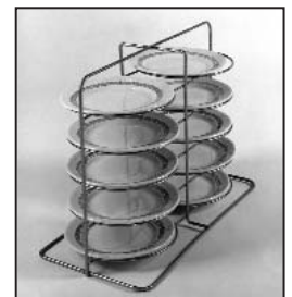
"P" carrier for open plates

OPTIONAL PLATE CARRIERS... "P" or "C" carriers are available. "P" type holds 8-3/4" to 10-1/2" diameter open plates while "C" type holds up to 10-1/2" diameter covered plates. Specify type, if any, when ordering. Carriers will hold plates 4-high (8C or 8P) in carts with 13" shelf spacing and 5-high (10C or 10P) in carts with 16" shelf spacing. See table on front page for types and quantities that will fit in each cart.