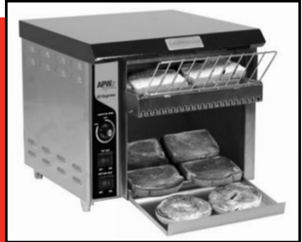
AT EXPRESS RADIANT CONVEYOR TOASTER