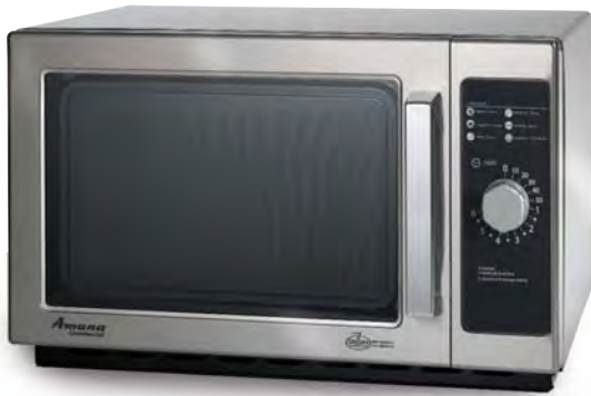
Model RCS10DS shown